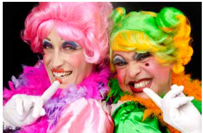
The Uglies Take Penge Previous cast